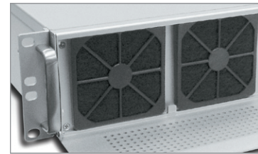
Front Replaceable Air Filters Convenient to change air filters when needed