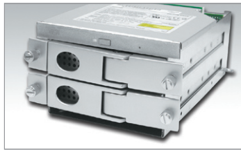
Hot-Swappable HDD Drives Easy to access HDD drives