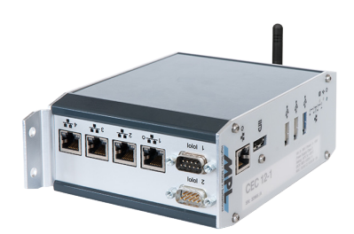
Standard solution with WLAN